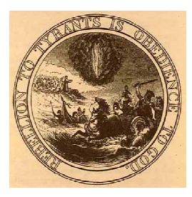
Benjamin Franklin's design for the Great Seal, 1776

The U.S. National Archives and Records Administration has described the Great Seal of the United States as "the symbol of our sovereignty as a nation". This seal authenticates treaties, warrants, proclamations and other official government documents on which it is used. The front of the Great Seal includes the design that serves as our national coat of arms. As such, it is a heraldic device.